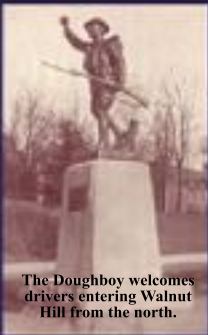
The Doughboy welcomes drivers entering Walnut Hill from the north.