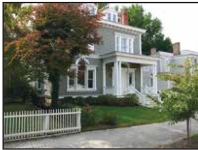
410 W. Washington Street, 2012 Christmas Tour.

In a NEW partnership between HPF and the Battersea Foundation, this year's Christmas Homes Tour will take place on Sunday, December 8th at a NEW time - 12-4pm and light refreshments will be served at a NEW location. Battersea will be the site for refreshments as well as a spectacular concert afterward. This NEW event is designed to benefit each organization while providing an entertaining afternoon for the community. Both HPF and the Battersea Foundation ask for your support in what promises to be a wonderful day guaranteed to put you in the Christmas spirit. More details will be available soon.