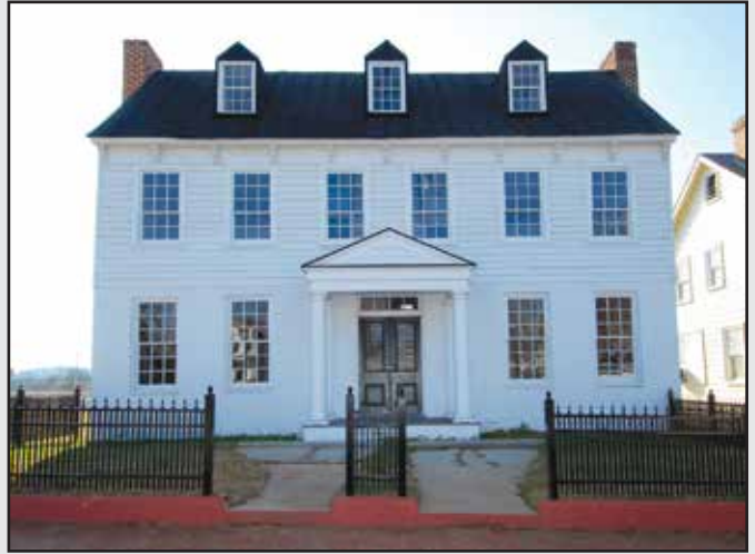
318 West Washington Street