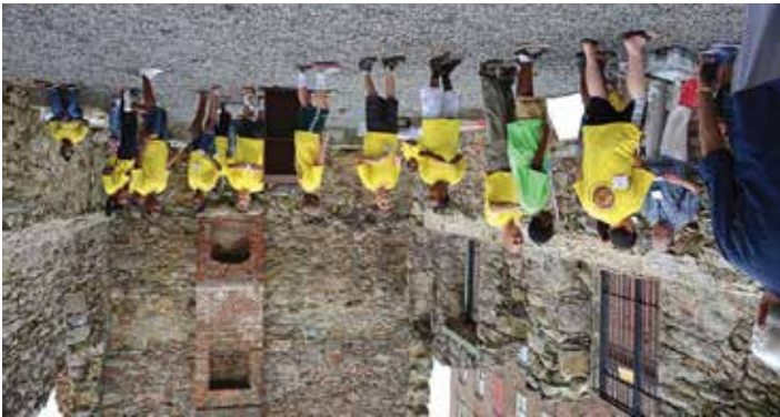
Week of Wonder History Camp