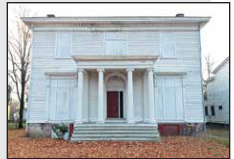
The Morriss House 116 Liberty Street Square ft.: 3,644

An Italianate circa 1830 with separate kitchen building and alley access to stone carriage building. This showplace had during its life world renown landscape architect Charles Gillette designed gardens. Restore this magnificent home and you will have a gem! Walk-up attic and full English basement not included in the square footage. House is located in the Poplar Lawn Historic District. Covenants apply.