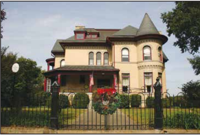
High Street Inn, 405 High Street, Christmas Tour 2012.